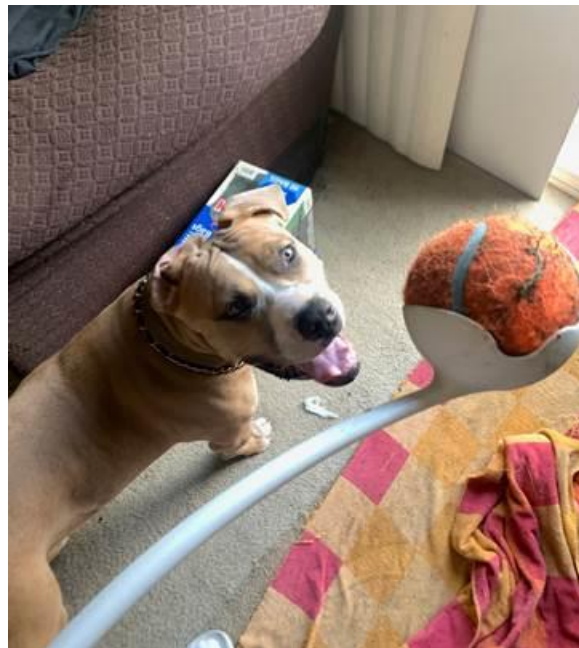
Tyson (A1945918), now Samson is living his best life. His family shared, "He's great with other dogs, gets along with the family cat, and spends his days soaking up as much affection as he can."