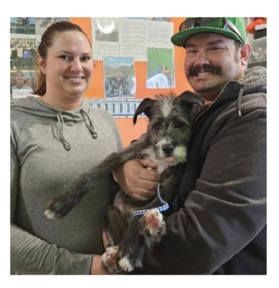
Transport pets finding their forever homes