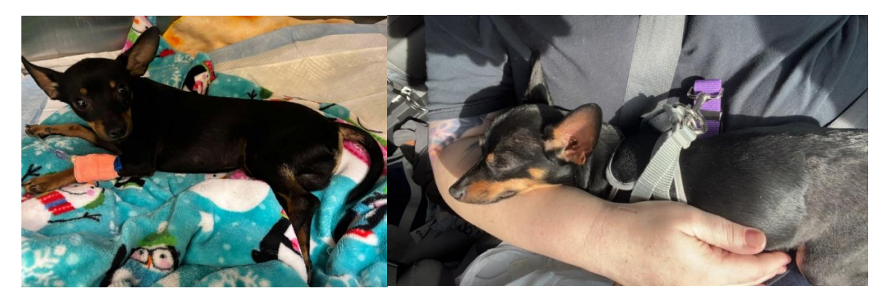
Mr. Deebo, before and after his medical treatment.

Mr. Deebo came into the shelter as a stray with multiple injuries consistent with being hit by a car including a fractured leg and pelvis, as well as a possibly fractured tail. Our veterinary team provided him with stabilizing care and treatment, but due to the severity of his condition, we reached out to our partners for help. Luckily, one of them was able to provide the prolonged treatment and out of shelter recovery that he needed. After a few weeks and surgery, he started to be more of himself! He has been making great progress and will soon be ready for his adoptive home where he has two silblings and a bed with his name embroidered on it waiting for him!