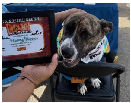
We showcased 4 dogs at Barktoberfest at Tewinkle Park in Costa Mesa. Two of the dogs that attended were in foster care, and it gave our foster caretakers a chance to show them off to potential adopters. One of our dogs even won Best Dressed in the Costume Contest.