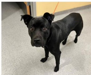
1-year-old Pit Bull Mix found on the street alone in Fullerton on 2/7/24

Lost and Found Pets: Most importantly, if you find a lost or stray pet, OC Animal Care asks for your help in locating their family by reporting to your local animal control agency, checking with neighbors, and posting found information on social media sites, community forums, and Nextdoor. OC Animal Care posts a photo and description of each animal brought into the shelter in hopes that they will be reunited with their family on our website . These are just a few of the furry faces that arrived during the storm. If any of them look familiar, please call or visit OC Animal Care.