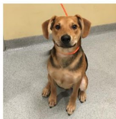
1-year-old Pit Harrier Mix found running down the street in Brea on 2/6/24