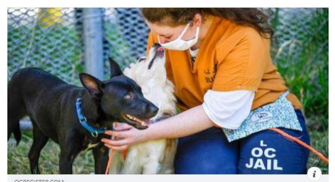
'Make sure they feel loved:' Women incarcerated at Orange County jail train dogs for adoption

donation drives at all 7 of their local branches and helped us gather hundreds of items for the shelter and Pet Pantry event.